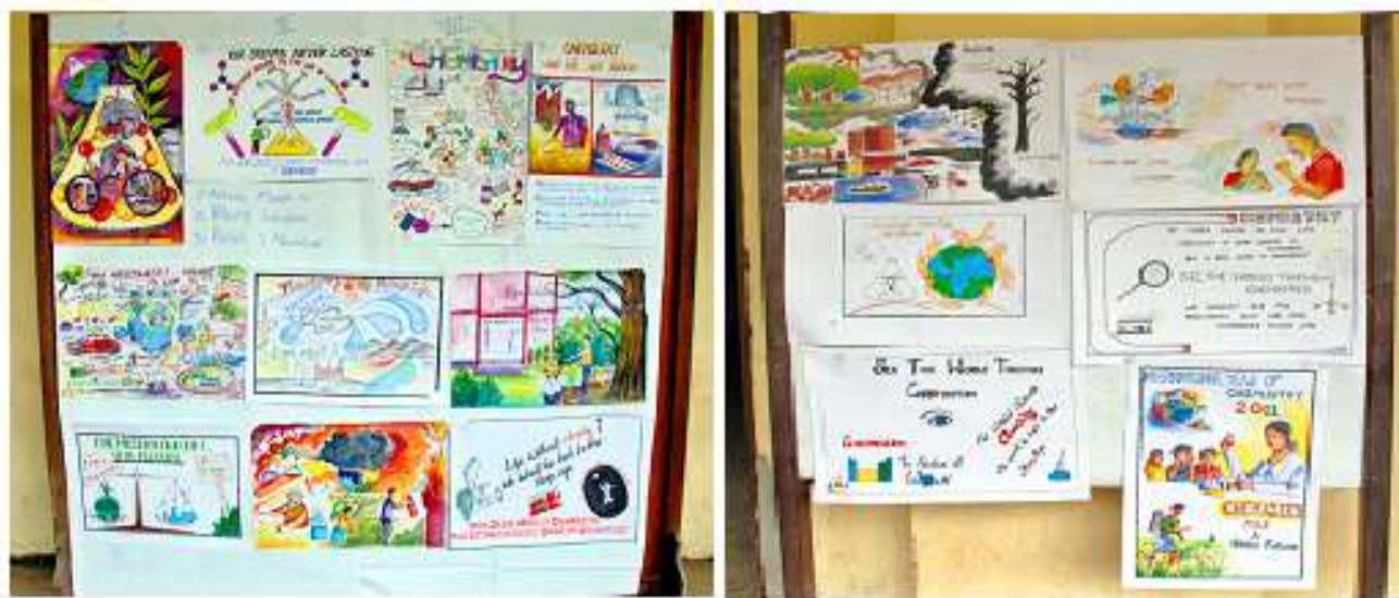
Posters from the competition being displayed.

A poster designing competition based on the theme of IYC, 'Chemistry: Our Life, Our Future', was held on 25 th February 2011 for students. The winners were given prizes on 28 th February, the National Science Day.